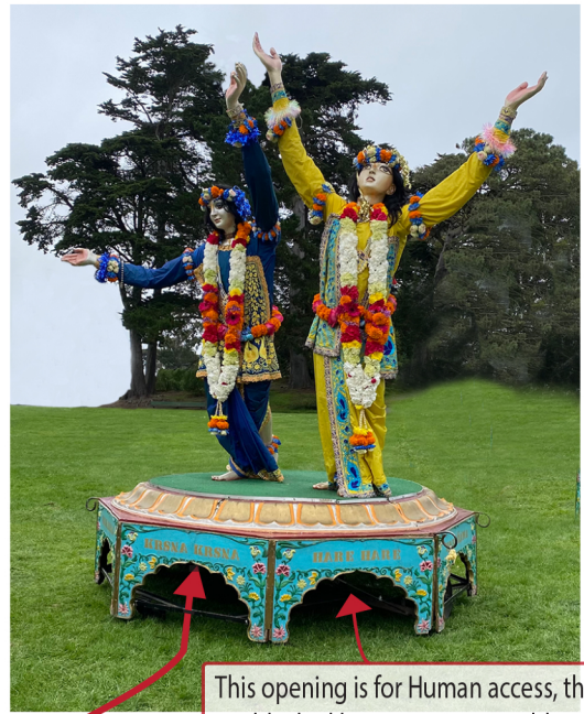
This opening is for Human access, the rest are blocked by corner iron & cable