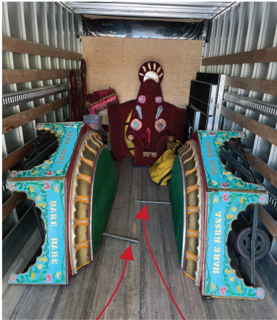
Initial load lay-out for 25' truck. Notice 2 steel pipes at float floor, be careful, tripping hazard. Lashings will be next, then Gaura-Nitai are placed.