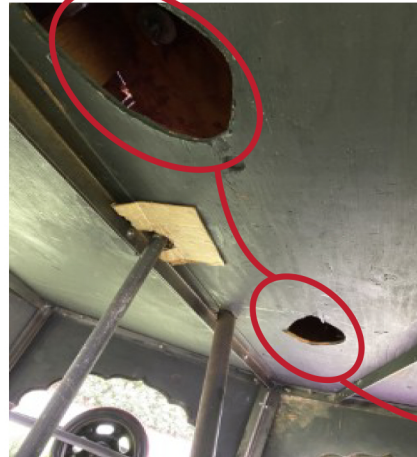
This photo is of the access holes located under the floats floor. 1bolt in each opening for GAURA & NITAI.