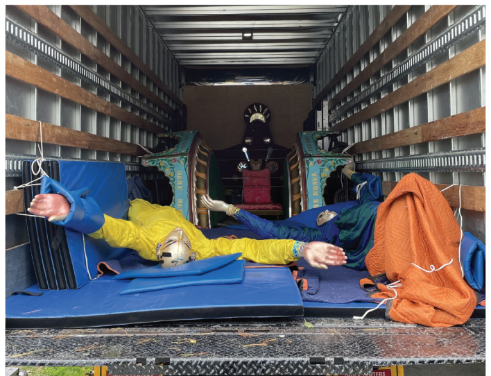
With GAURA-NITAI on mats, at backend. Tools, small items and boxes may be placed around open space, as long as they won't fall or bump into other items.